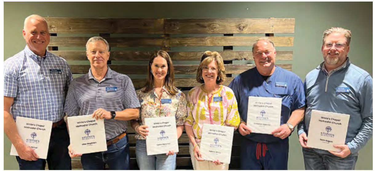
Surrounded by family, friends and church leaders, White's Chapel's newest Stephen Ministers were commissioned for ministry, preparing to offer Christ-centered care and support to individuals facing life's challenges.