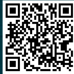
Work Group & Rooming Requests