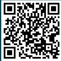
Food Allergies & Dietary Restrictions