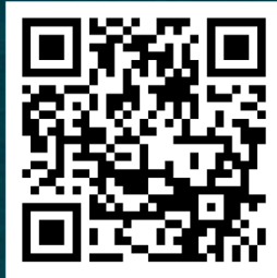
Mission Trip Payment Link